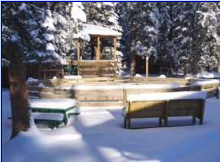
The snow-filled Willsonball court lays in wait for warmer weather when rambunctious campers will play endless rounds.

For more details please check out our 2017 Summer Camp brochure or our website.