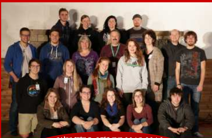
WINTER STAFF 2015-2016

Wishing you a joyful, Christ-filled Christmas from our family to yours!